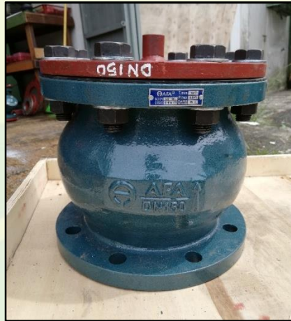
Figure 5: Photograph of test sample AFA Silent Check Valve DN 150.

This Test Report refers only to samples submitted by the applicant to SIRIM QAS International Sdn. Bhd. and tested by SIRIM QAS International Sdn. Bhd. This Test Report shall not be reproduced, except in full and shall not be used for any purpose by any means or forms (including but not limited to advertising purposes) without written approval from the Managing Director, SIRIM QAS International Sdn. Bhd. Please refer the last page for Conditions Relating to the Use of Test Report.