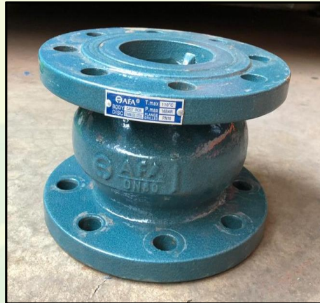
Figure 3: Photograph of test sample AFA Silent Check Valve DN 80.

This Test Report refers only to samples submitted by the applicant to SIRIM QAS International Sdn. Bhd. and tested by SIRIM QAS International Sdn. Bhd. This Test Report shall not be reproduced, except in full and shall not be used for any purpose by any means or forms (including but not limited to advertising purposes) without written approval from the Managing Director, SIRIM QAS International Sdn. Bhd. Please refer the last page for Conditions Relating to the Use of Test Report.