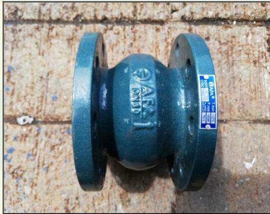
Figure 1: Photograph of test sample AFA Silent Check Valve DN 50.

This Test Report refers only to samples submitted by the applicant to SIRIM QAS International Sdn. Bhd. and tested by SIRIM QAS International Sdn. Bhd. This Test Report shall not be reproduced, except in full and shall not be used for any purpose by any means or forms (including but not limited to advertising purposes) without written approval from the Managing Director, SIRIM QAS International Sdn. Bhd. Please refer the last page for Conditions Relating to the Use of Test Report.