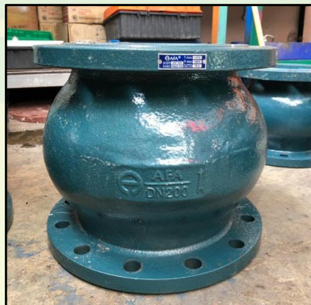
Figure 6: Photograph of test sample AFA Silent Check Valve DN 200.