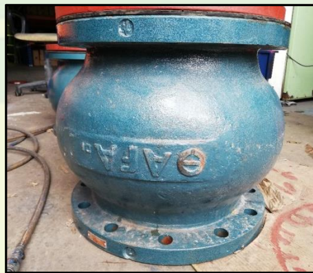
Figure 7: Photograph of test sample AFA Silent Check Valve DN 300.