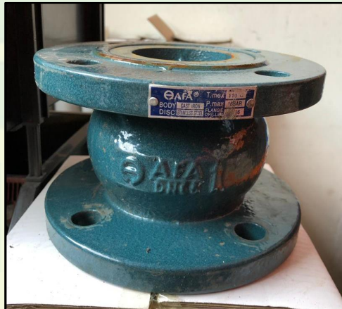
Figure 2: Photograph of test sample AFA Silent Check Valve DN 65.