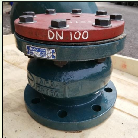
Figure 4: Photograph of test sample AFA Silent Check Valve DN 100.