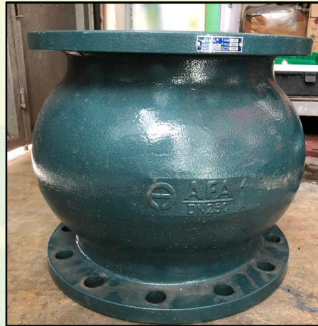
Figure 7: Photograph of test sample AFA Silent Check Valve DN 250.

This Test Report refers only to samples submitted by the applicant to SIRIM QAS International Sdn. Bhd. and tested by SIRIM QAS International Sdn. Bhd. This Test Report shall not be reproduced, except in full and shall not be used for any purpose by any means or forms (including but not limited to advertising purposes) without written approval from the Managing Director, SIRIM QAS International Sdn. Bhd. Please refer the last page for Conditions Relating to the Use of Test Report.