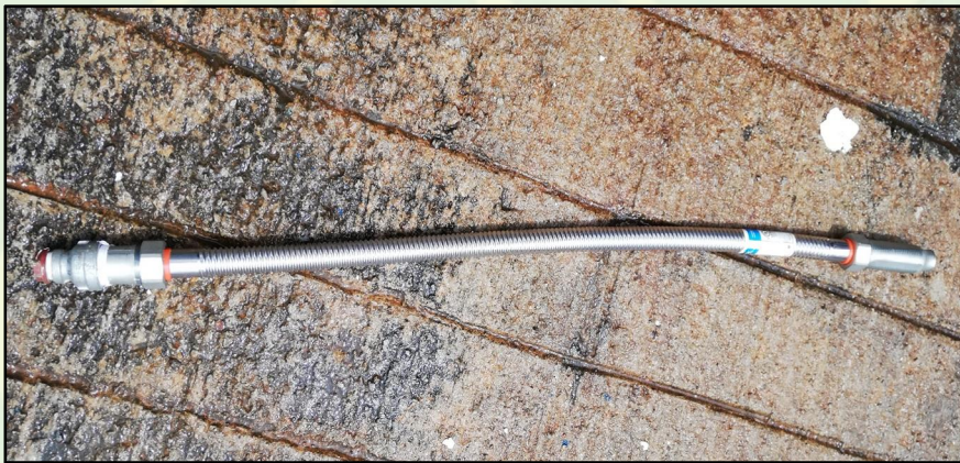
Figure 1: Photograph of test sample.